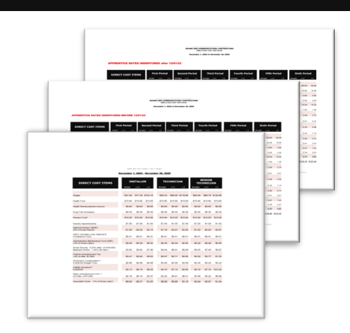
Schedule E: Cost/Hour